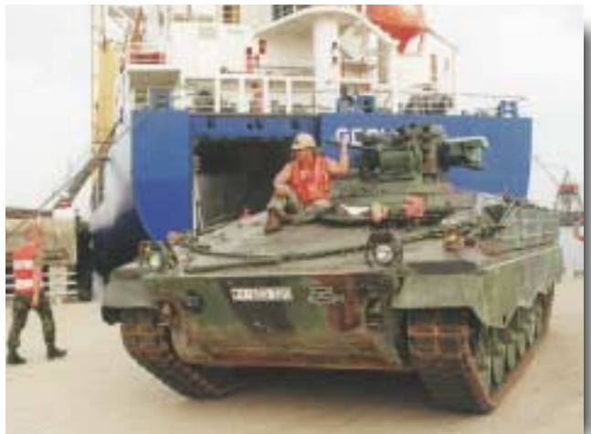
Fifty-five metric tons of tank being unloaded at the Port of Beaumont's roll on-roll off ramp. The German military hardware was bound for Fort Bliss and desert training exercises.

Since its reunification as one nation in 1990, German soldiers have served as NATO peacekeepers worldwide. By January, the soldiers who trained in Fort Bliss will be deployed in Bosnia for six months of peacekeeping duties.