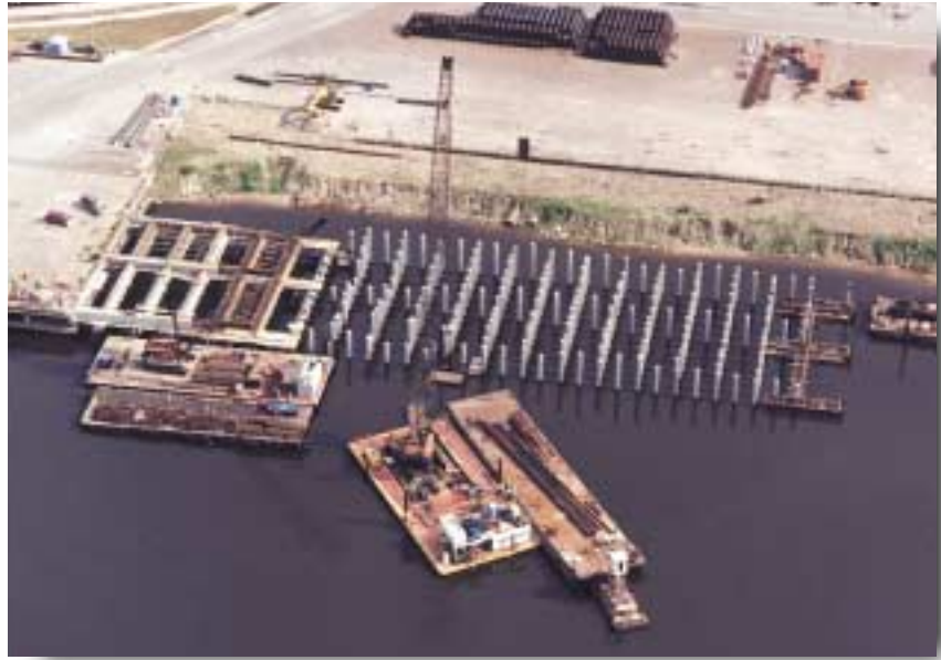
Construction to extend the Harbor Island Wharf includes driving more than 540 prestressed concrete pilings that will support a new wharf deck.

$1.5 million in improvements are the initial step toward developing 4,300 linear feet of port owned waterfront property in Orange County.