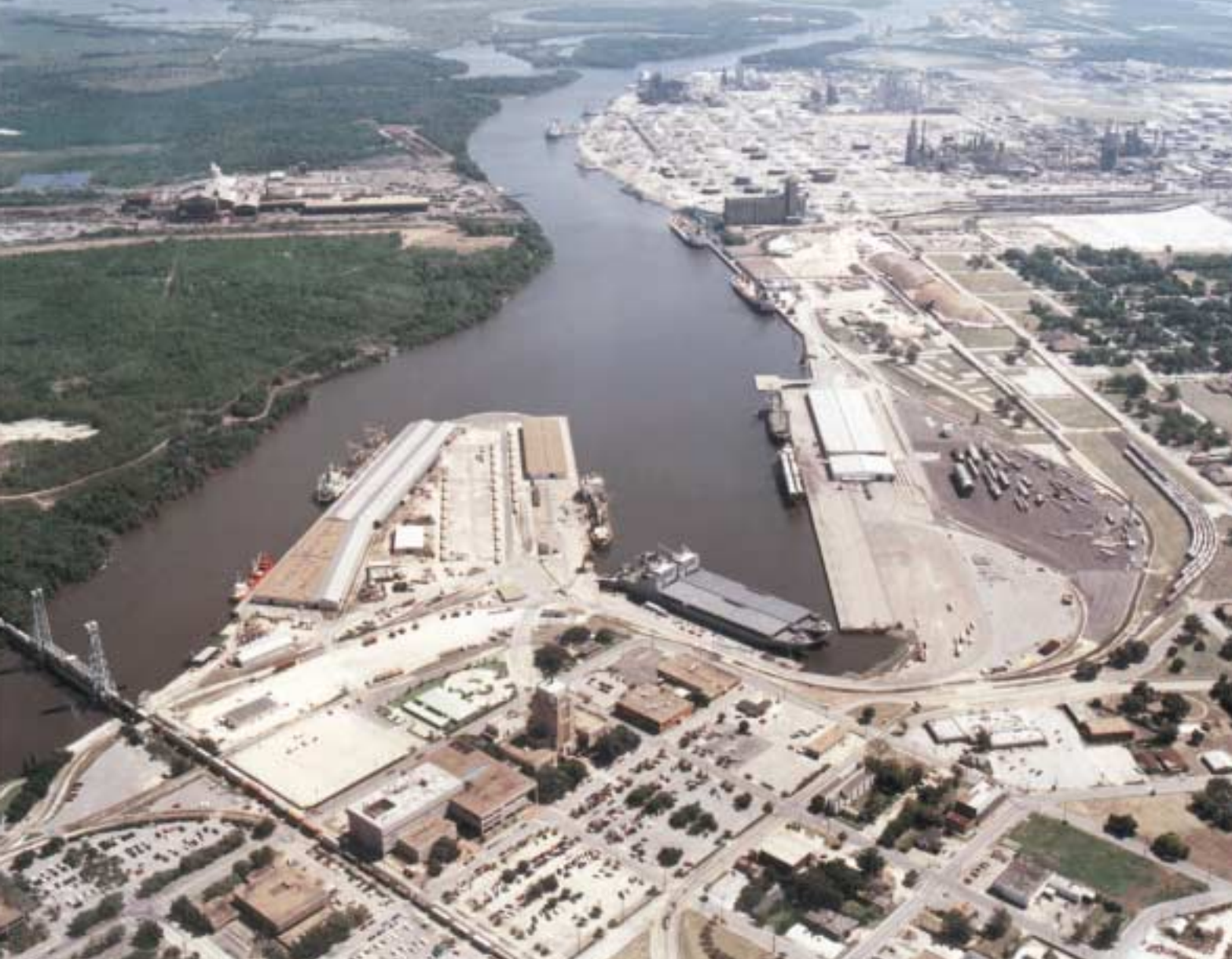
A graphic rendering of what an extended Harbor Island wharf will look like when construction is completed in Spring, 2001.