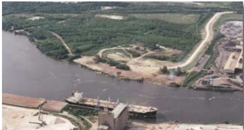
The completed roadbed on the east bank of the Neches River in Orange County is the foundation for future transportation to this port-owned property.