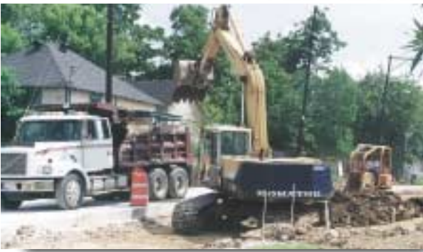
Paving the way for the newly completed Port of Beaumont/ MLK Parkway connection.

A completed Franklin Street project has paved the way for a direct link between the Port of Beaumont's main gate, at Main and Franklin, to MLK Parkway and onward to Interstate 10.